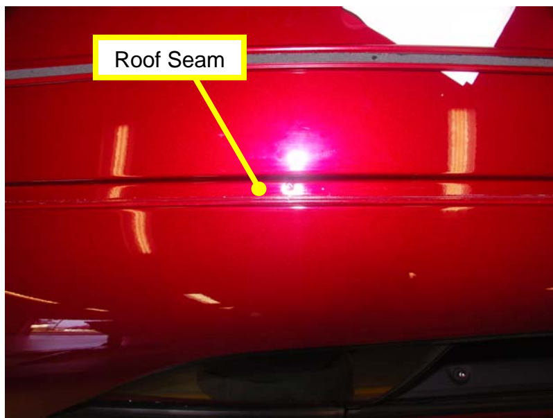
Figure 2 - Roof Seam

NOTE: Do not use powered / wheel type adhesive removing tools. This may damage the seam sealer and/or painted surfaces of the roof seam.