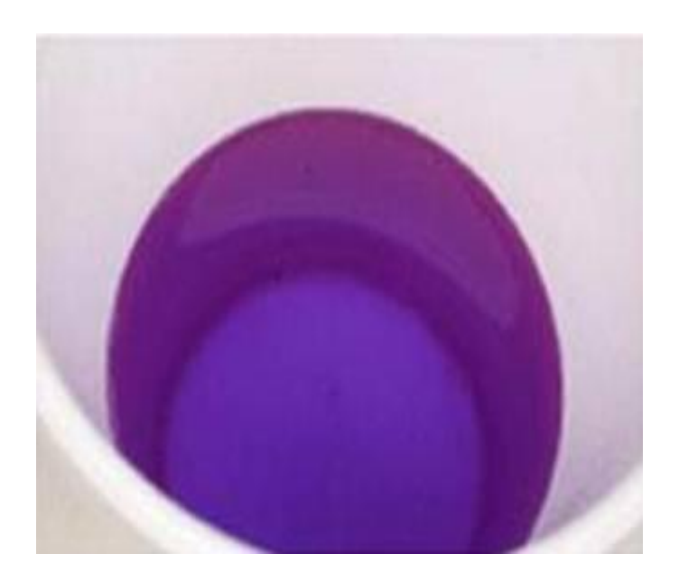
Fig. 1 Purple OAT Coolant

NOTE: If OAT (MOPAR P/N 68163848AA Purple) has been Mixed with HOAT (MOPAR P/N 68048953AB Pink Or Factory Fill HOAT Orange (Fig. 2) or (Fig. 3)) or any other coolants have been mixed, it will be necessary to flush the cooling system.