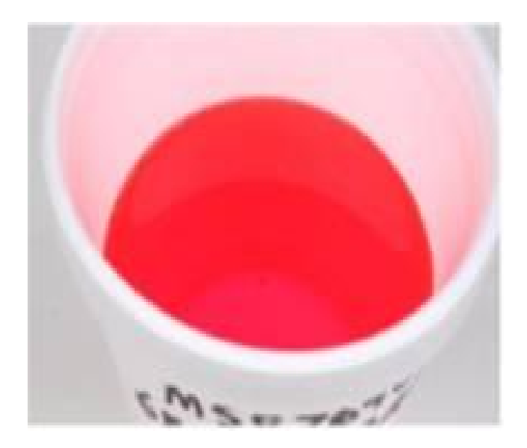
Fig. 2 Pink HOAT Coolant

1 - MOPAR P/N 68048953AB Model Years 2000 to 2012