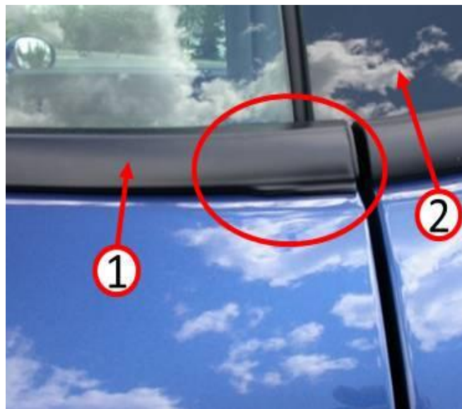
Fig. 2 Drooping Condition